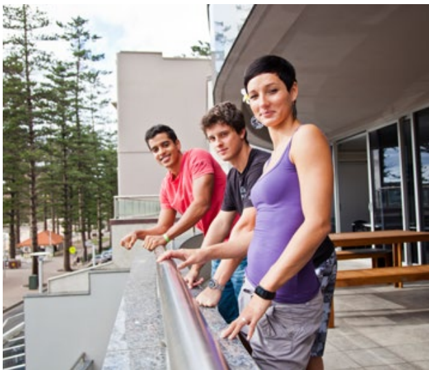
Kaplan International Sydney Manly

Other facilities include a multimedia library where students can access a variety of online and audio-visual resources, a spacious student lounge leading on to the large balcony and of course step outside the door and you are on the beach!