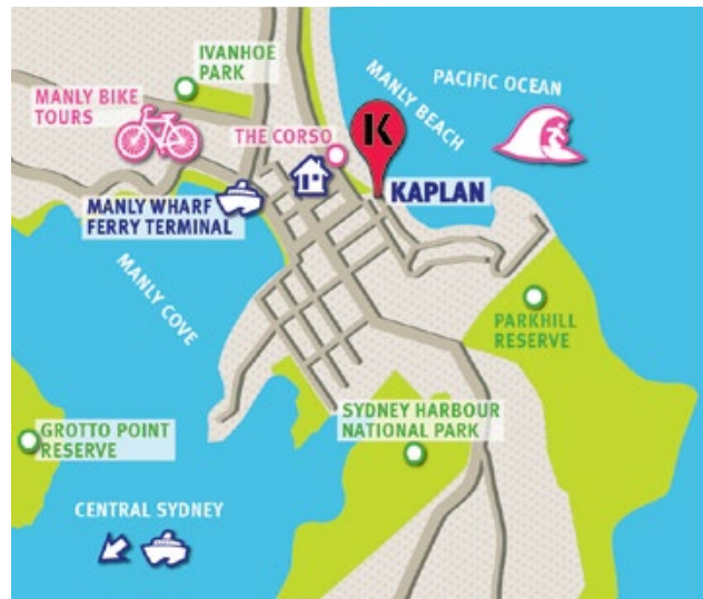
Kaplan International Sydney Manly 30-32 South Steyne Manly NSW 2095 Australia